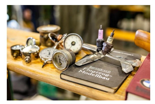
The fair has everything on the subject of historic aircraft